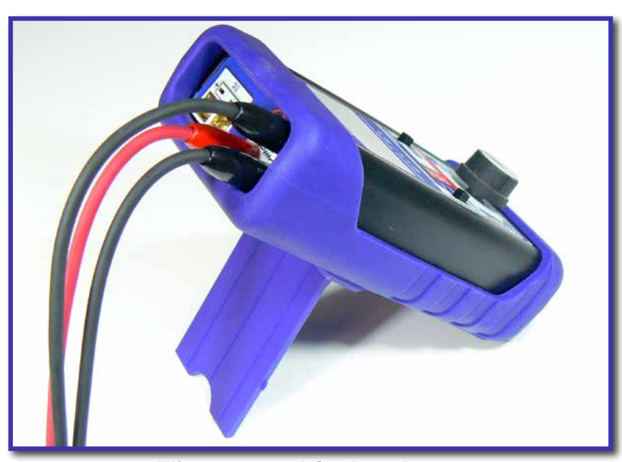
Flip out stand for bench use