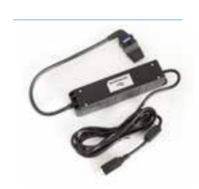
USB communications lead